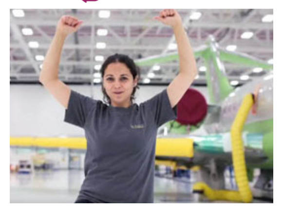
Look back on the early song that motivated Unifor activists to form our