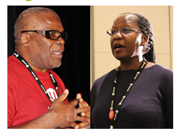
Each week, Unifor is profiling Black activists who are making the union, their